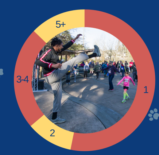
How many times have you participated in the White Center 5K Walk N'Run, including this time?