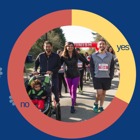
Do you live in White Center?