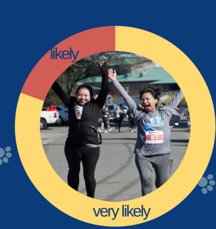
How likely are you to recommend this event to a friend?